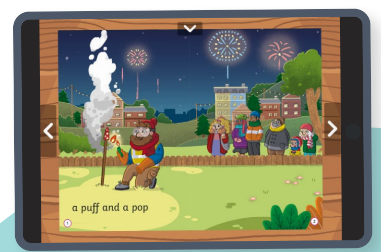
Level 3a Pop and Bang

The user profiles and content controls allow specific books to be selected from the library for each child to read at their own pace. The app remains fully accessible offline, making Rhino Readers truly unstoppable!